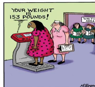
Talking scales: Proof that technology isn't always good.

How come women's magazines will Feature twelve pages of recipes, And then follow up with twenty pages Of diet tips???